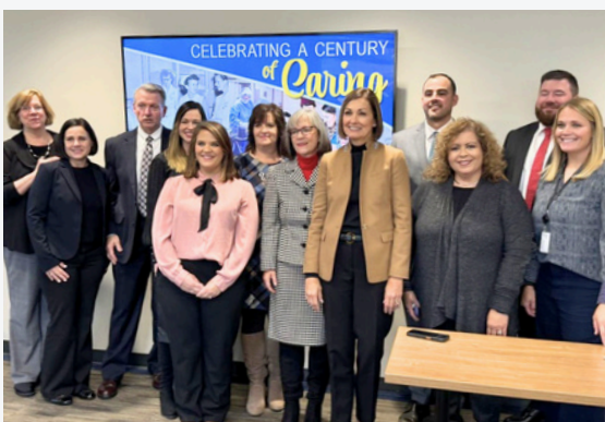
Governor Reynolds joined with the staff of the Iowa Office of Apprenticeship at the recent Broadlawn Medical Center RA Program news conference.

With the growth and expansion of our team, we hope to offer even more opportunities to serve our sponsors in the new year. We are committed to supporting your success, which in turn, helps Iowa fulfill their workforce pipeline!